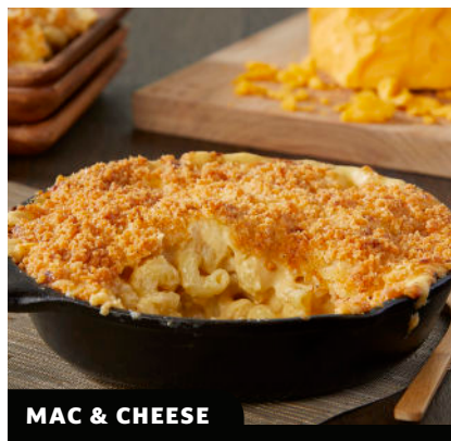
MAC & CHEESE